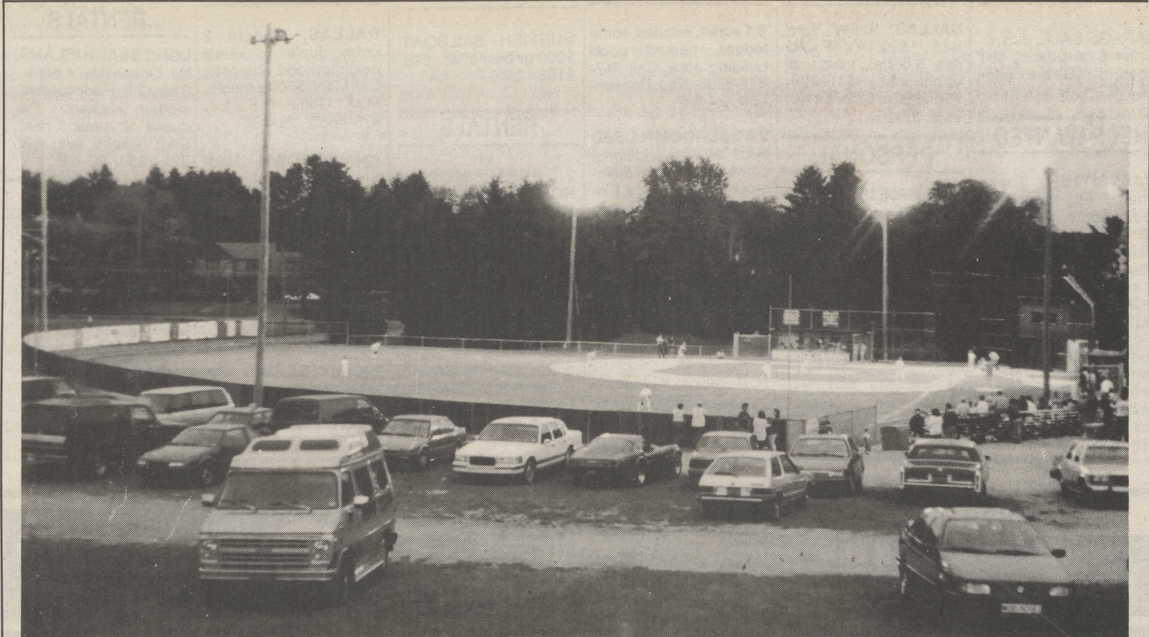
Field of dreams