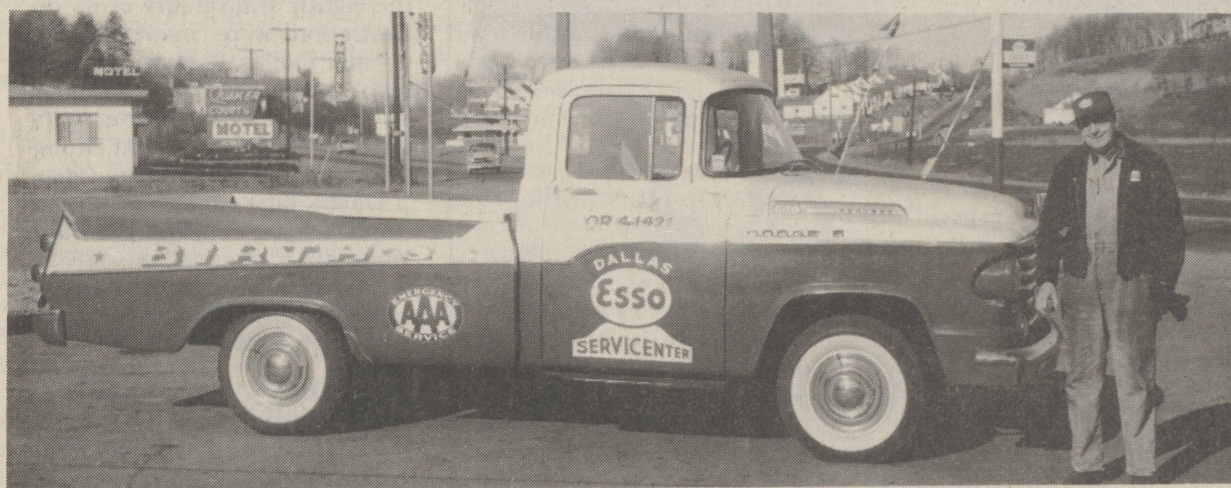
IN THE OLD DAYS - Dallas Esso station owner Clyde Birth showed off his new towtruck in this old photo of the Route 309/415 intersection, the future site of an Orloski's gas station, car wash, full-service bank and food mart.