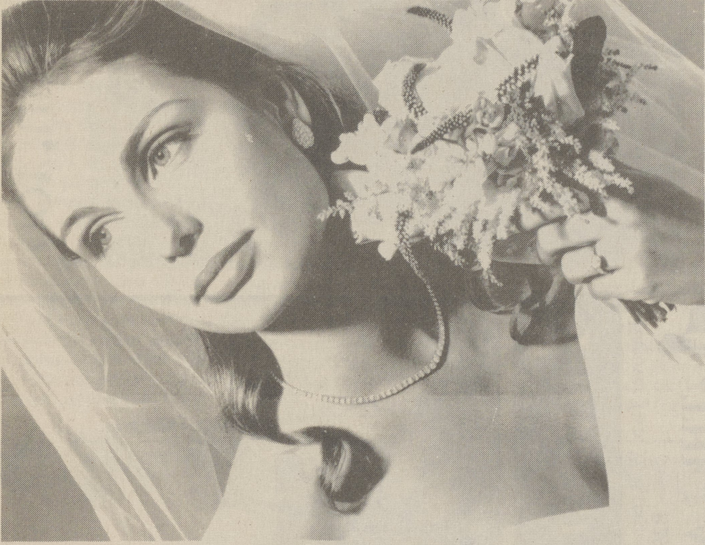
Wedding-day makeup should be bold enough to show up in pictures without being overdone.

Taking good care of your hair in advance of the wedding date will ensure its good looks regardless of the style you choose. Keep it in good shape with quality shampoo and conditioner, and get regular trims. Have your hair cut or colored at least six weeks in advance, so you have time to get used to it or change it if you absolutely hate it.