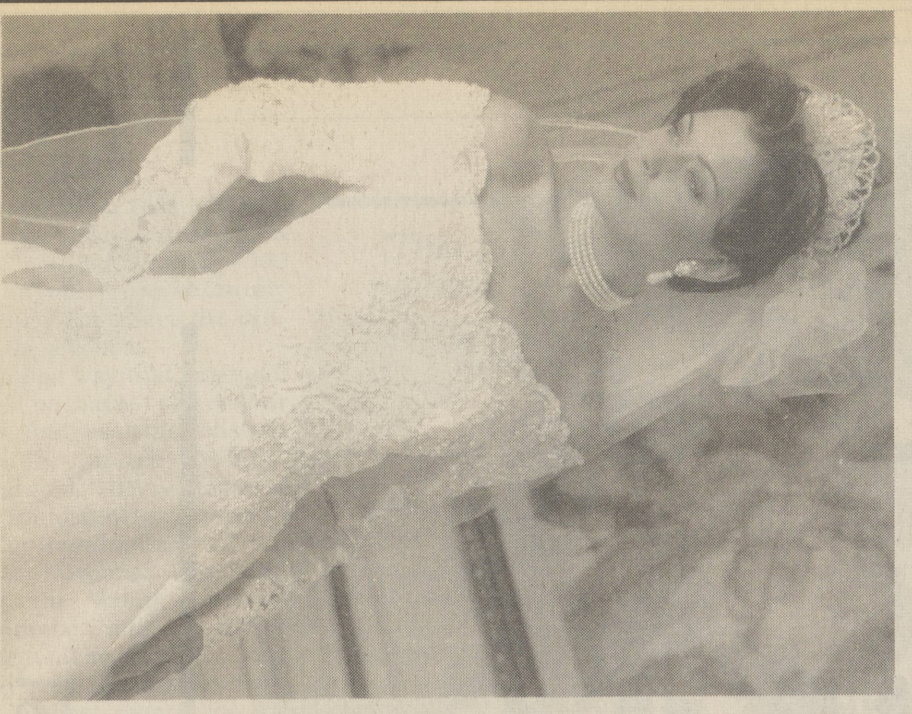
Continuing our Winter Coat Clearance Sale

You are Cordially Invited... to come and browse...see our exquisite collection of bridal gowns and bridesmaid gowns for Spring.