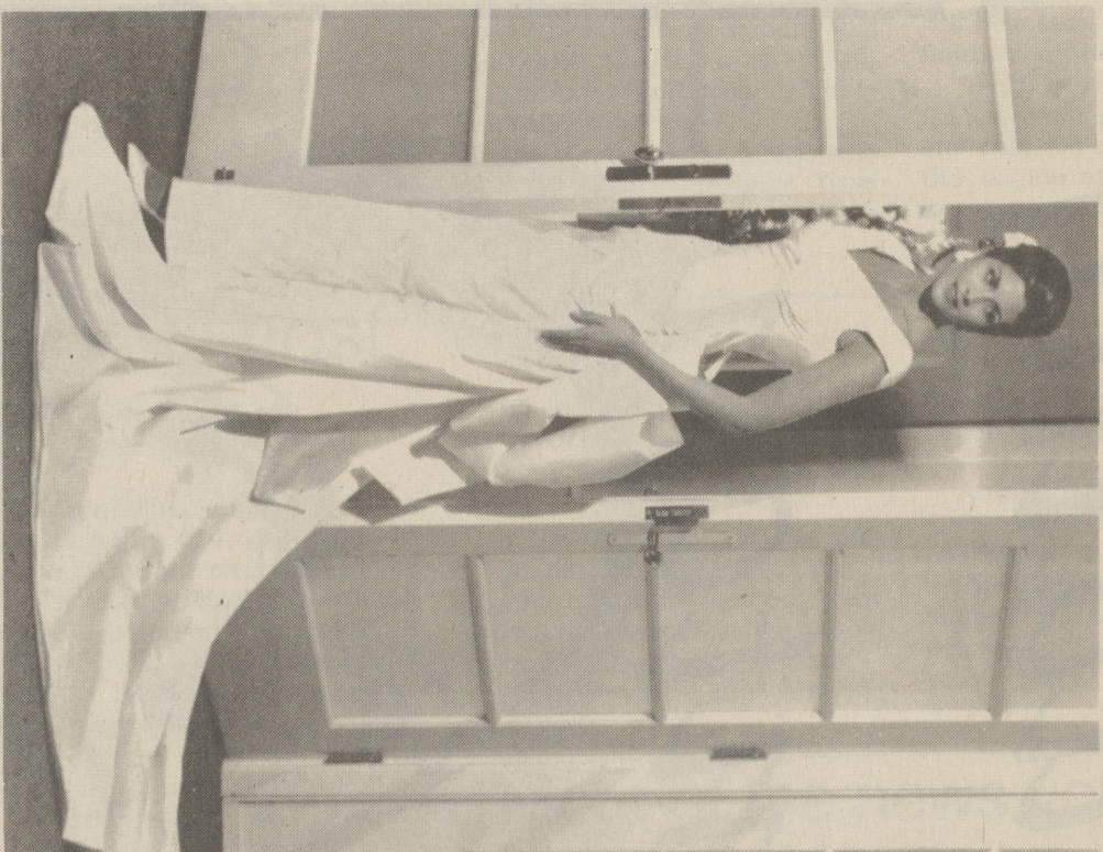
A simple body-hugging satin sheath with detachable chapel train highlights the elegant simplicity many brides seek this season.

The shape of a wedding dress is the most important choice of style which to embellish with decoration and accessories. As always, styles to fit all tastes are available for the upcoming wedding season, from simple and sleek to elaborate, opulent and ornate.