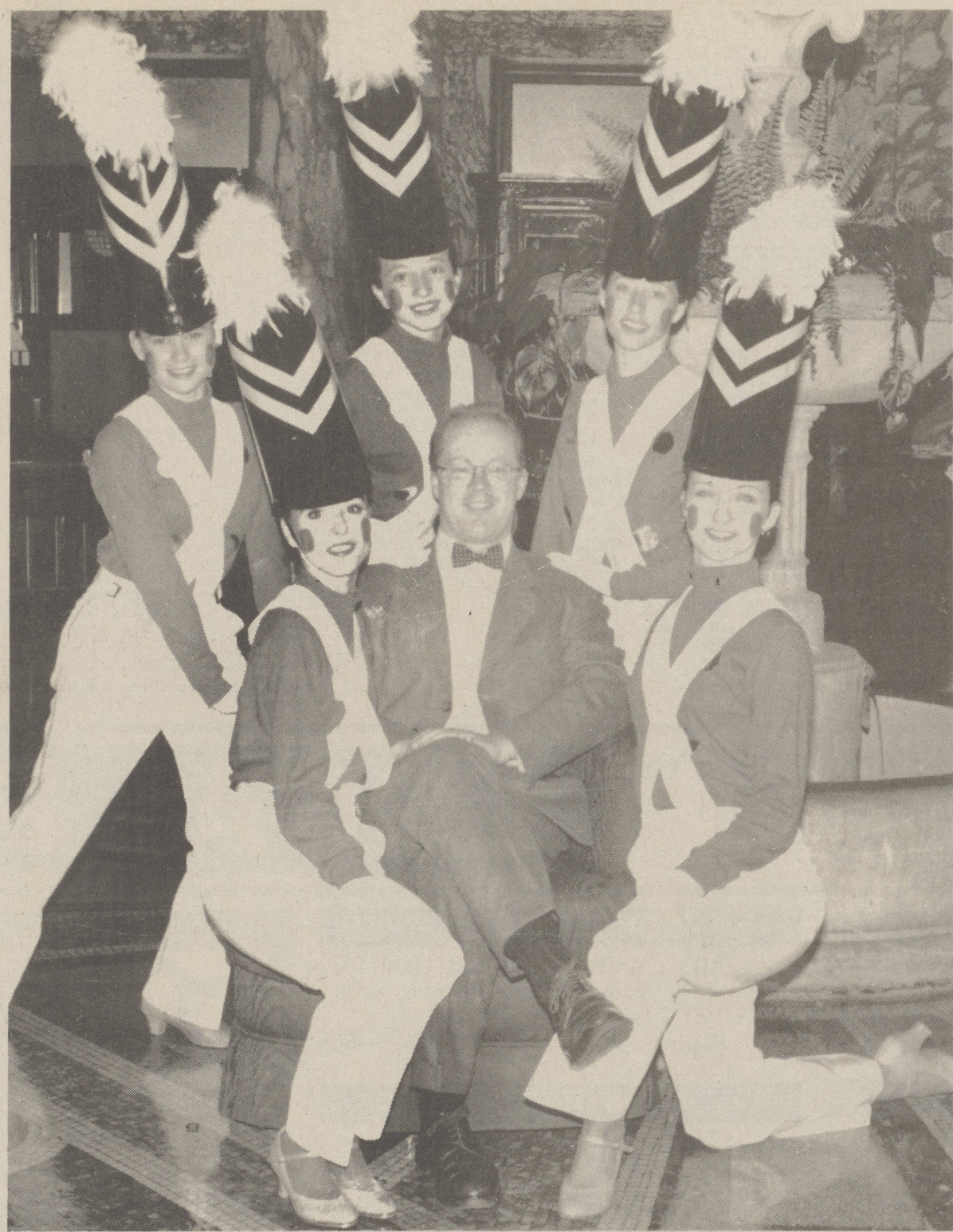
Wooden soldiers, a magic nutcracker and Christmas carols