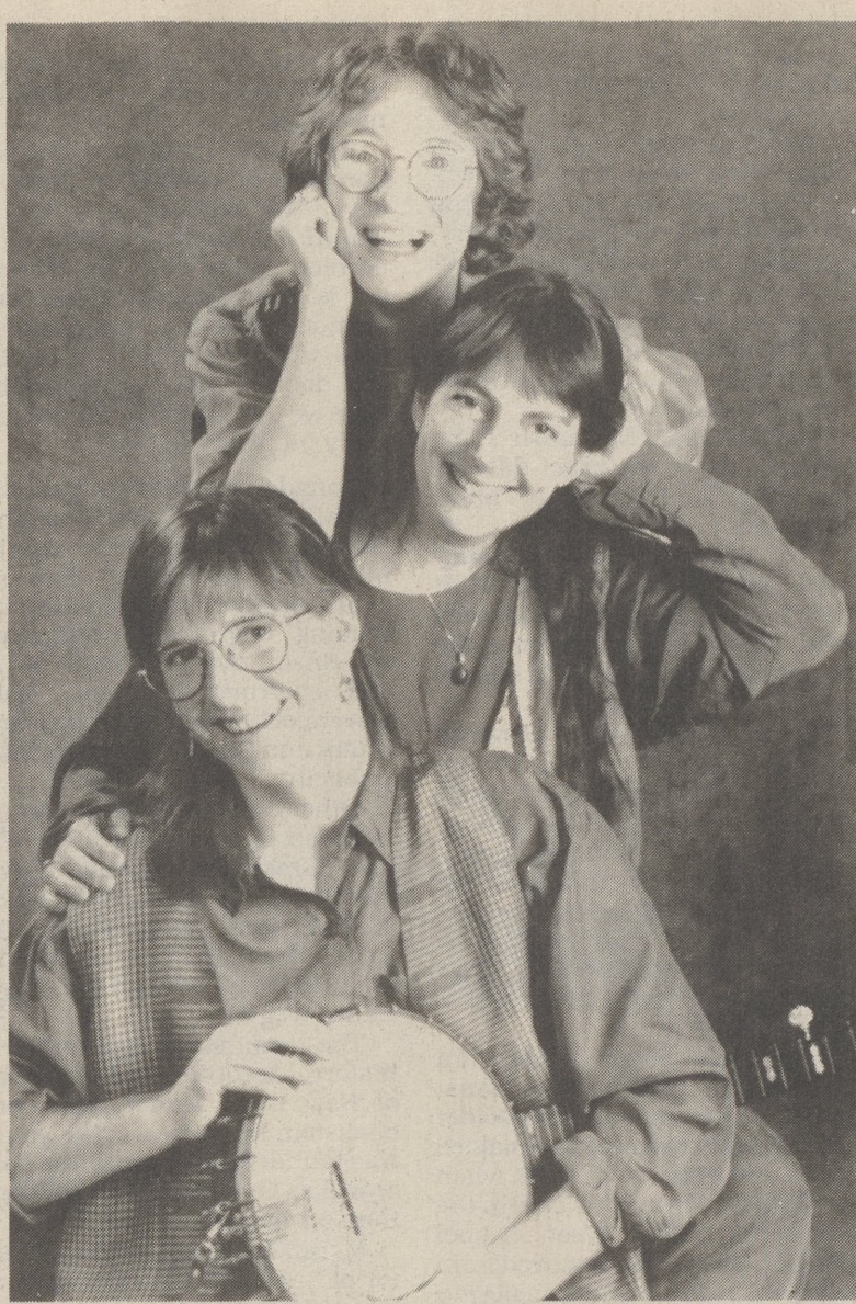
NOT SHORT, NOT RELATED - The Short Sisters folk group will appear in concert December 9 at the Chicory House.