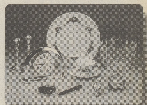
Save on all china, crystal, giftware and clocks

A diamond ring valued at over $1,100 and 5 gift certificates for $107.00 each.