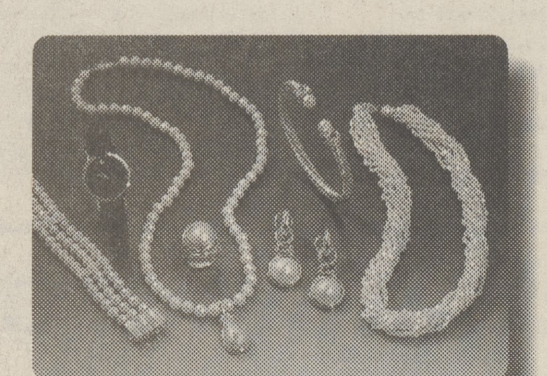
Save on all pearl jewelry