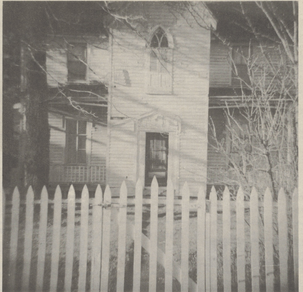
SOFT IMAGES - Photographer Phillip Dente used a toy camera and special effects to capture the soft images of places and things on film. His photos are on exhibit at College Misericordia's MacDonald Gallery.