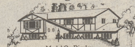
Model On Display

56' X 28' Bi-Level • Oversized 2 Car Garage • 2000 Sq. Ft. Living Area