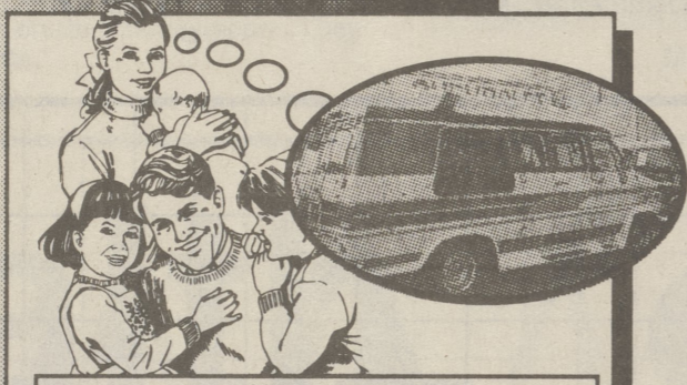
Most With Color TVs, Automatic, Central Air, Roof Rack, Indirect Lighting, Lighted Mirror Headliner, Stainless Steel Continental Kit