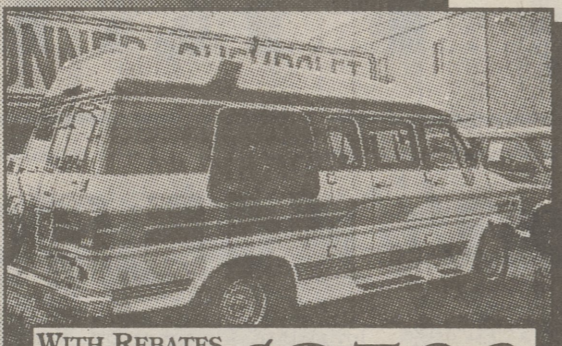
WITH REBATES AND DISCOUNTS $3500 SAVE UP TO