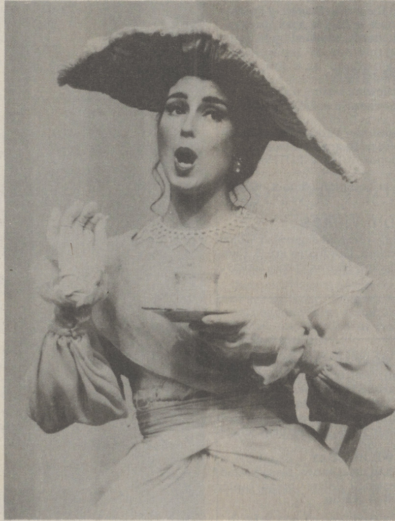
I COULD HAVE DANCED ALL NIGHT - The Kirby Center will present the popular musical My Fair Lady Sept. 30. Tickets are still available.

Hit song after hit song make up the score of "My Fair Lady" from "Wouldn't it Be Lovely" through "With a Little Bit of Luck", "The Rain in Spain", "I Could Have Danced All Night", "On The Street Where You Live", the rousing "Get Me To the Church On Time," the acerbic "Without You" to the wistful "I've Grown Accustomed to Her Face".