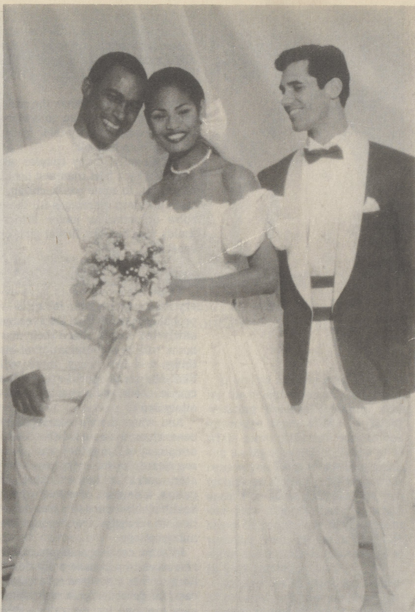
From cut to colors, grooms can make their own fashion statement on the big day.

Regardless of their level of formality, tuxes often follow the world of men's fashions in terms of shoulder width and trouser fullness. Formal wear can be found in