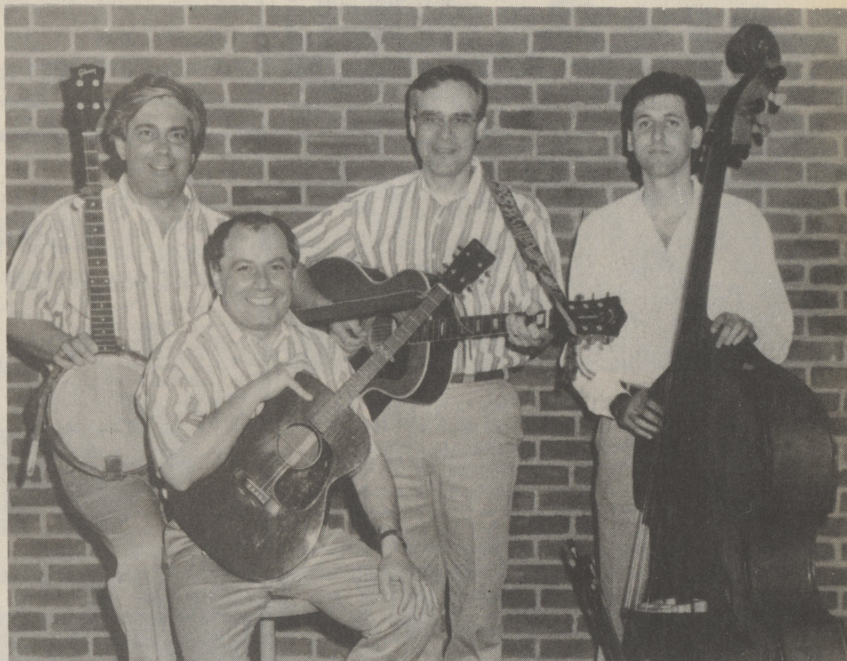
SUMMER ARTS FESTIVAL — Performances by the popular Anzalone Brothers and Company and the folk/rock group Just Us will be featured with artists, food and crafts vendors at the Arts at Hayfield festival August 27-28.