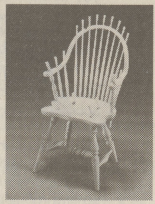
Side Chair Prices Starting at $209

Something you never see, but it is important to know.