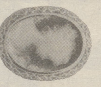
Cameos, a Timeless Treasure

DALLAS FAMILY PRACTICE Sterling and MacNeill Avenues, Dallas 675-2111 A service of Wyoming Valley Health Care System