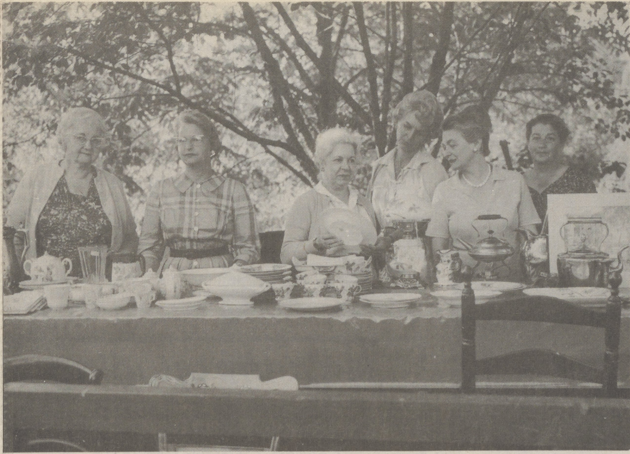
1960 - Serving ware and accessories filled this table during the Back Mountain Memorial Library Auction 34 years ago. There will be that and more when this year's auction kicks off July 7.