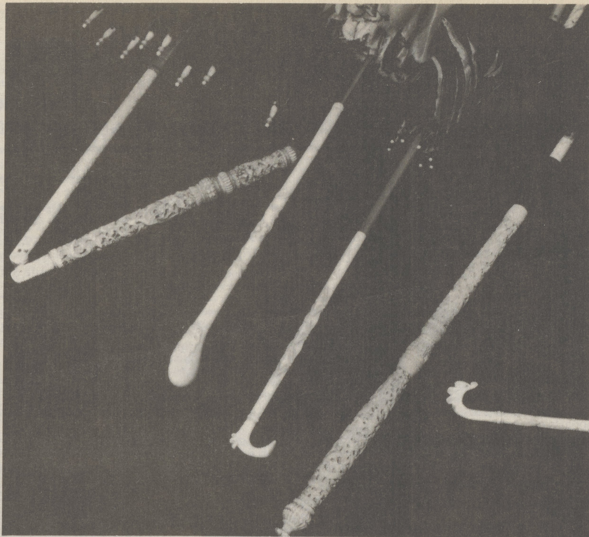
PRETTY PARASOLS, UNIQUE UMBRELLAS - The intricately carved handles of these parasols and umbrellas will be featured in "A Parade of Parasols and Umbrellas" at College Misericordia's MacDonald Art Gallery July 1-31.

SHAKESPEARE FOR CHILDREN, an interactive theatre workshop program for elementary school children, also a theatre workshop and a production assistant program, presented by College Misericordia's Theatre-On-The Green. College Misericordia, Dallas, July. For dates and details, 674-6368.