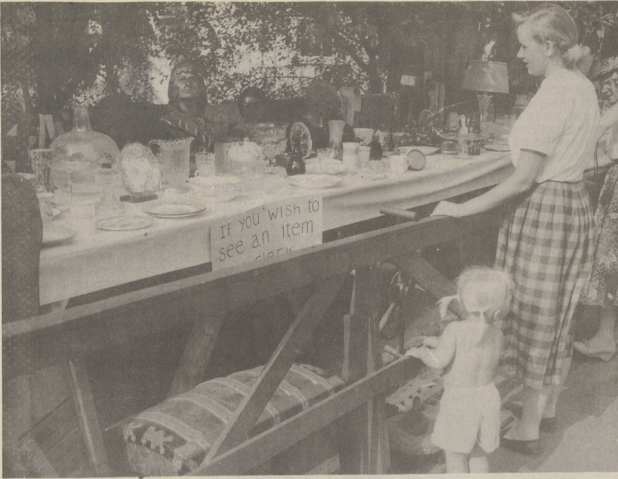
AUCTION '55 - Glassware was one of the big items at the Back Mountain Memorial Library Auction in 1955. It still is, and many of these items would be quite attractive today.