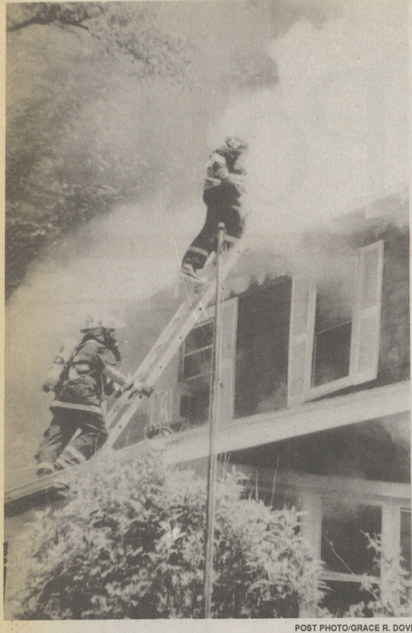
HOT AND SMOKY - Firefighters fought to contain a blaze on Harris Street in Dallas Township last week. The fire gutted the home.