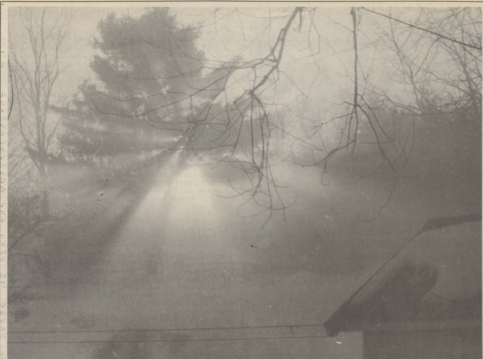
Can spring be far behind?