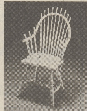
Side Chair Prices Starting at $209

Something you never see, but it is important to know.