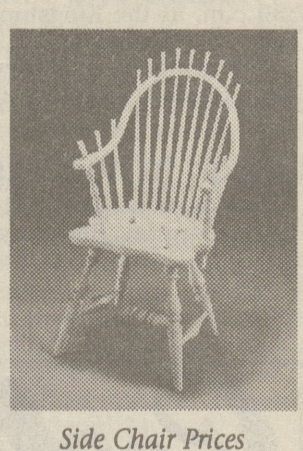
Starting at $209

Something you never see, but it is important to know.