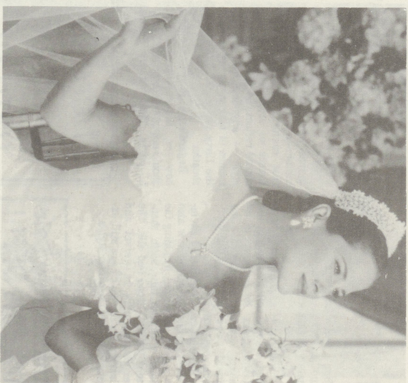
The bridal ensemble is more than a dress: hair, makeup and accessories complete the look.