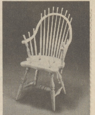
Side Chair Prices Starting at $209

Something you never see, but it is important to know.