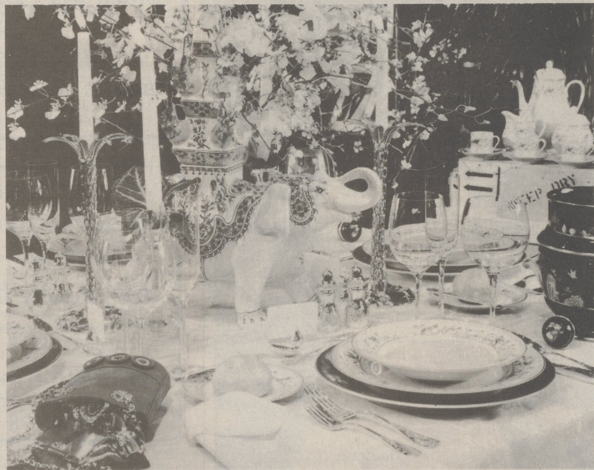
When you receive beautiful china, crystal and flatware as wedding gifts, don't hesitate to use them often.

vor for themselves as well. Instead of having guests sign a book, ask them to sign a tablecloth with indelible pens or a photo mat into which you later can insert a wedding photo.