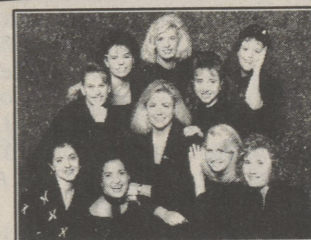
MPAC TEACHING STAFF

♪ TODDLER DANCE ♪ TAP • JAZZ • BALLET ♪ PRO-POP/BROADWAY VOCAL