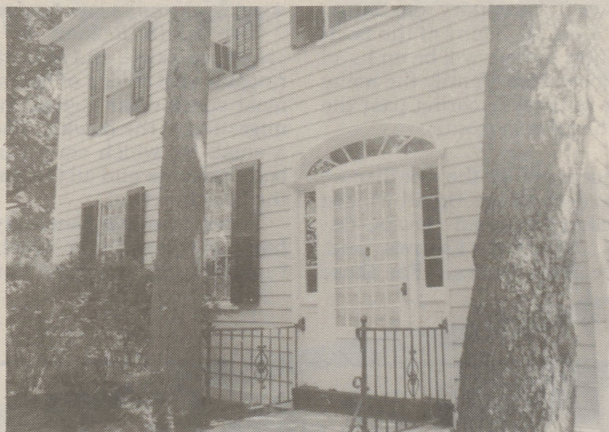
The exterior, and two interior views of the historic Baldwin - Rogers home.