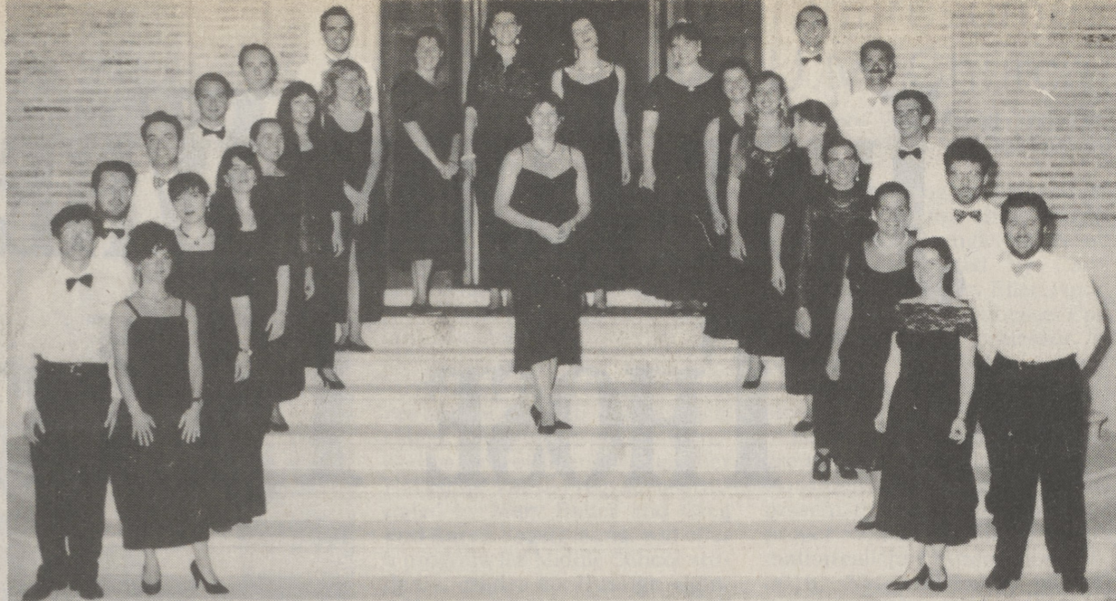
PREMIER CHORAL ENSEMBLE - Coro Labroatorio, Italy's premier professional choral ensemble, will open Wyoming Seminary's Performing Arts Series in a free public concert Monday, September 13.