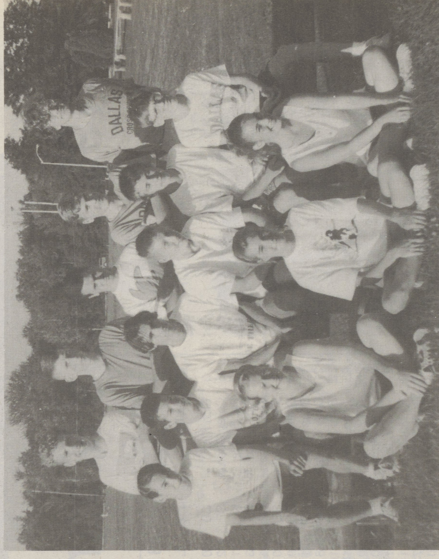
Dallas cross-country is one of the best teams in the state