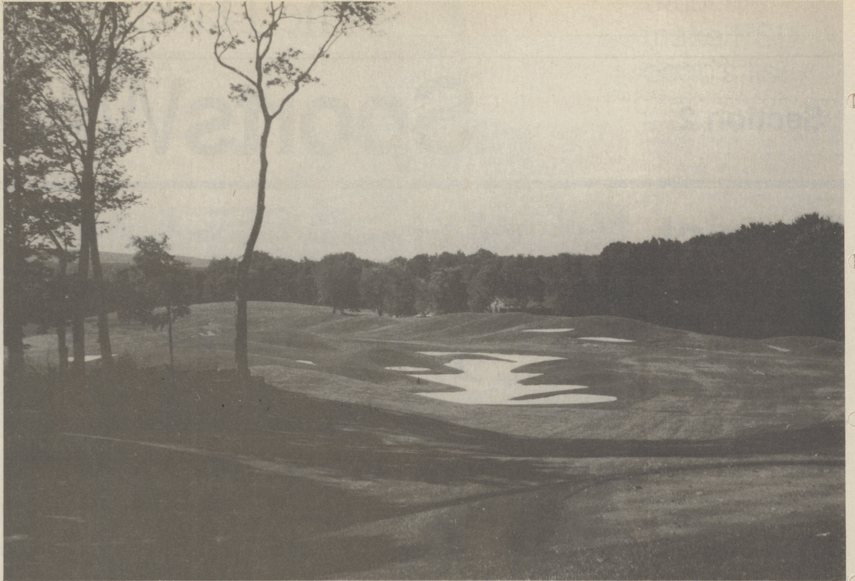
END OF THE FRONT NINE - The par 5, 580-yard 9th hole offers an undulating, bunker-protected fairway and green and plenty of

"This is going to be a members' golf course, first and foremost," added Foran. "The service we will render here will be as good as you can get anywhere. We think the quality of the clubhouse amenities, the instruction and the caddy program will be first class. That in itself is, perhaps, welcome in the community."