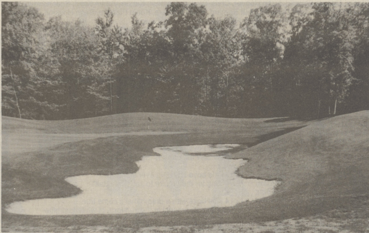
1st TARGET - The starting hole's green is guarded on the right by a long bunker. Strong hitters may try to reach the 500-yard par 5 in two.