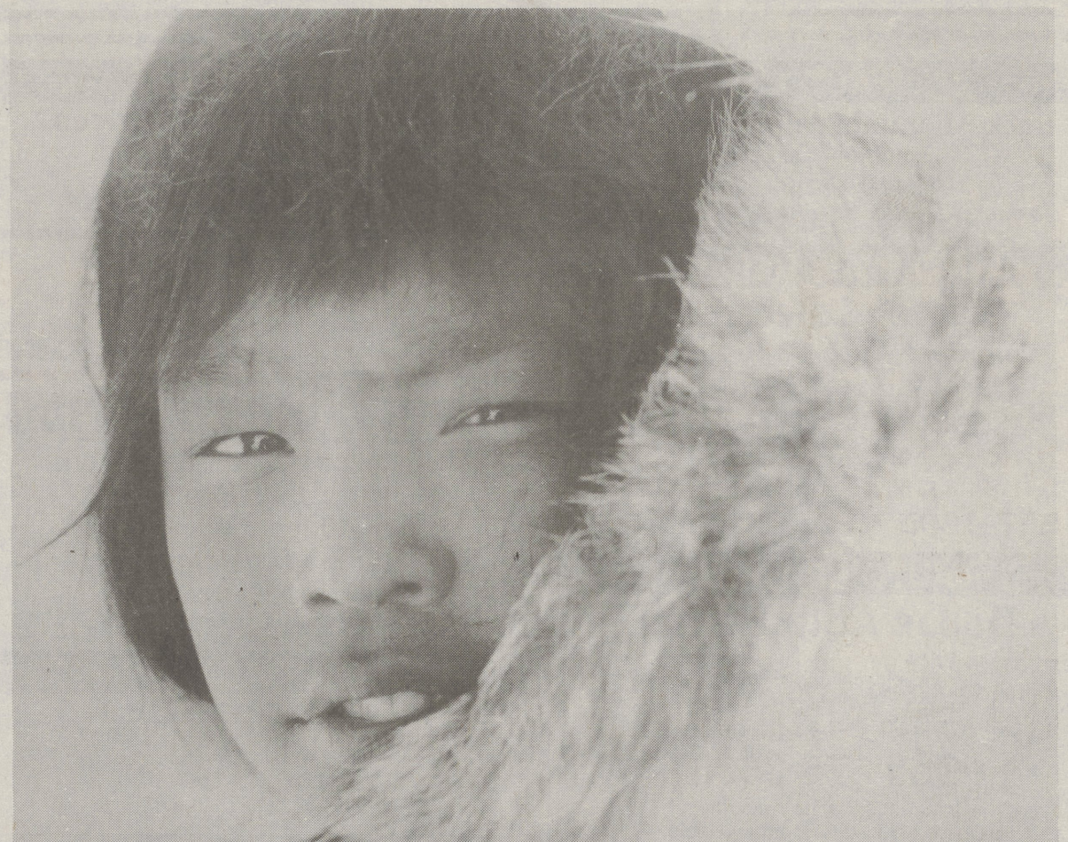
Map of the Human Heart, starring Patrick Bergin, Anne Parillaud, John Cusack and Jeanne Moreau, will be included in the Northeastern Pennsylvania Cultural Society's International Film Festival June 15-19.

Tickets for all performances will be available at the Kirby box-office.