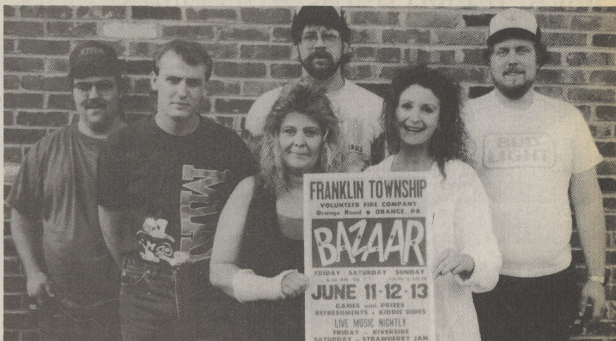
Bazaar planning committee