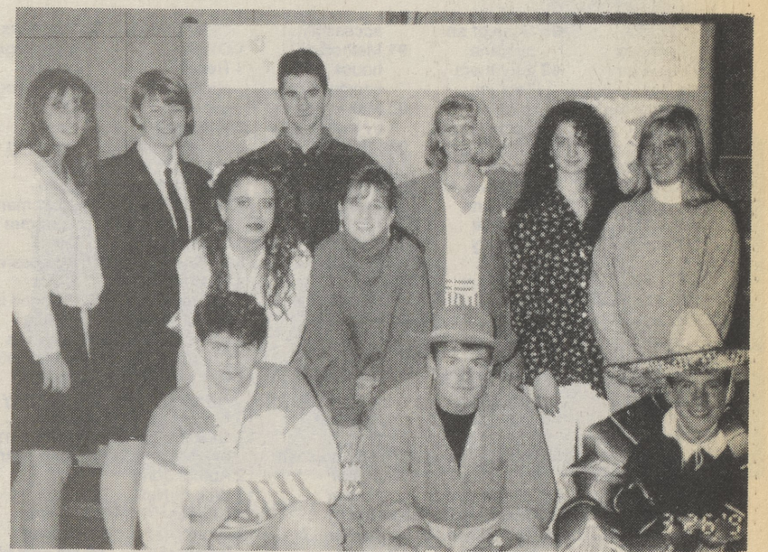
IMAGINARY TRIP— Ross Twp. students recently took an imaginary trip around the world as part of the Reading is FUNdaental program.