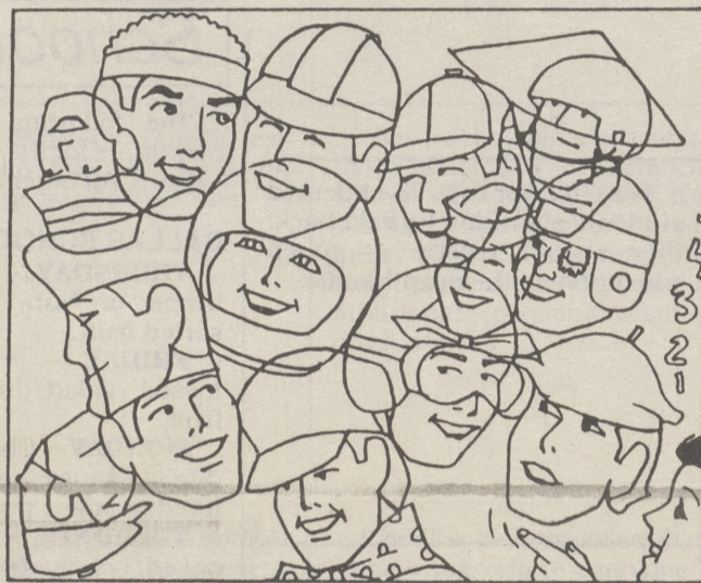
HAT STUFF! Our artist says there are as many as 15 persons wearing hats in the picture above. How many can you find?

Answers to Crossword, Challenger on page 14