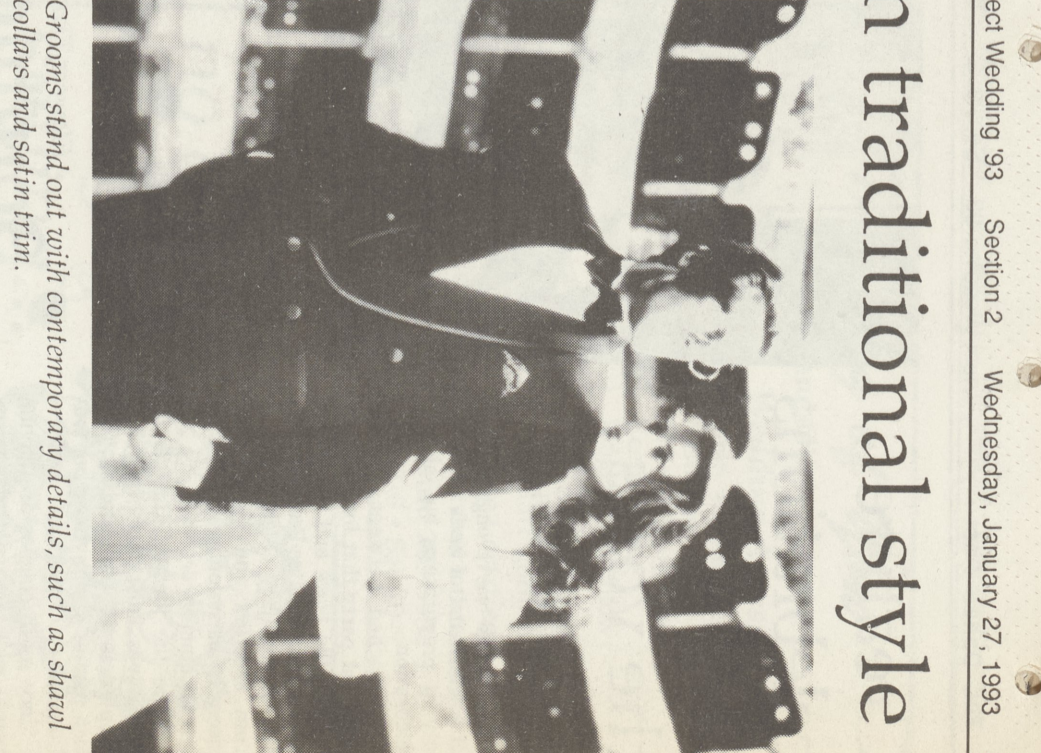
Grooms stand out with contemporary details, such as shawl collars and satin trim.