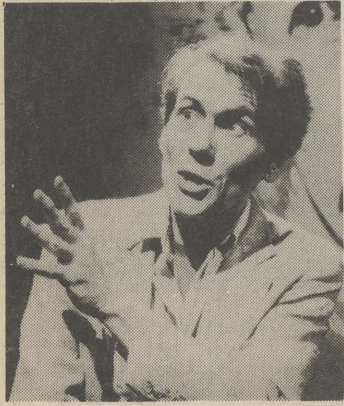
Mark Twain will make an appearance at Misericordia. Page 8.