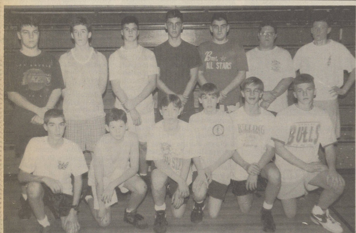
Dallas 9th grade basketball team

The Mountaineers will compete in the Crossin Memorial Holiday Tournament at Wyoming Valley West High School, in Plymouth, on December 28 and 30.