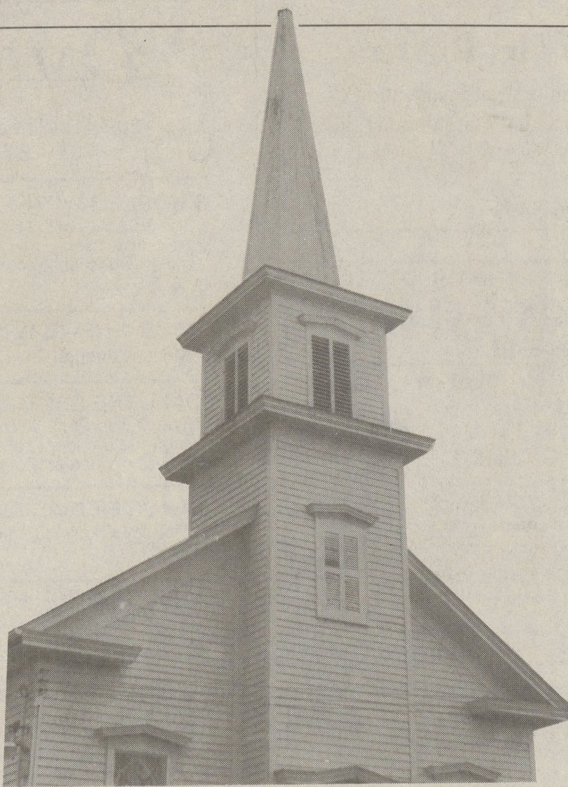
HUNTSVILLE UNITED METHODIST CHURCH