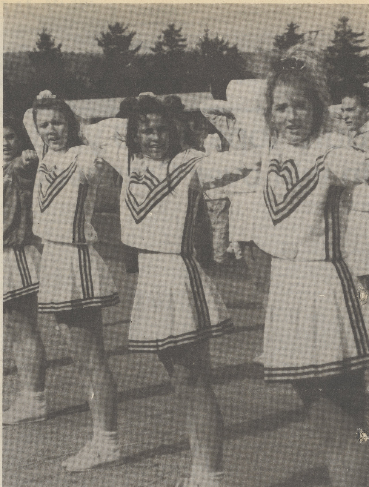
Cheering them on