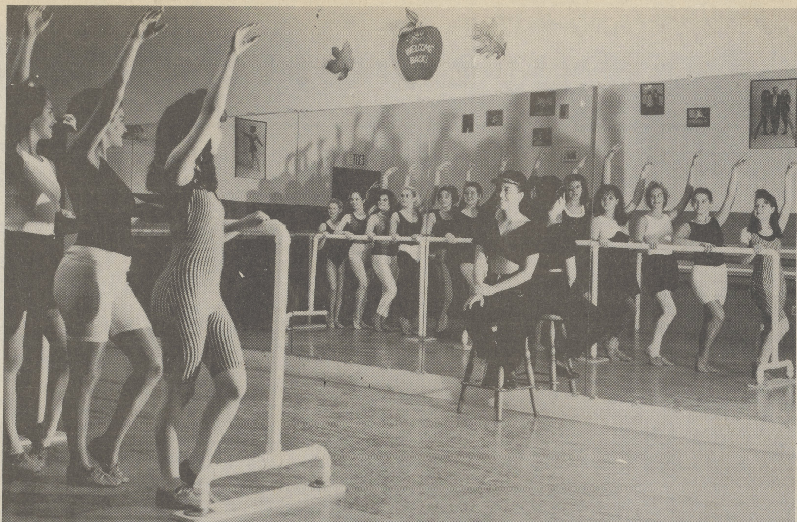
The Joan Harris Dancers will perform at the Luzerne County Folk Festival during Family Day October 17.

THROUGH OCT. 25, STEAMTOWN NATIONAL HISTORIC SITE 1992 EXCURSION including Labor Day and Columbus Day. Excursion will leave Lackawanna and 9th Aves., 1 p.m. sharp. Cost $10 for adults for 3-hour trip; children up to age 12 are $6. Groups of 24 or more adults remain at the individual price of $9. The site is located at 150 S. Washington Ave., Scranton.