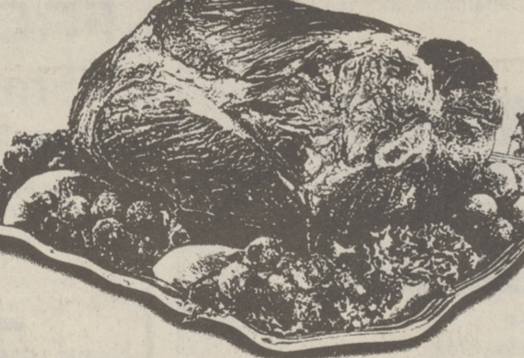
WHOLE, PORK SHOULDER

1/3 OFF ALL SARA LEE FROZEN FOOD PRODUCTS UP TO 29 ITEMS REDUCED!