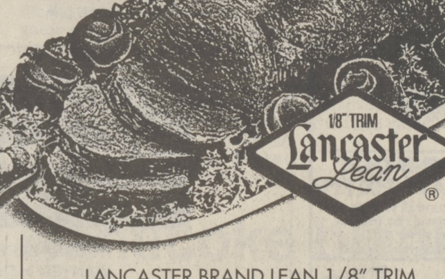
LANCASTER BRAND LEAN 1/8" TRIM BONELESS BEEF

Tenderloin (4-LB. AVG.) or NY Strip (7-LB. AVG.)