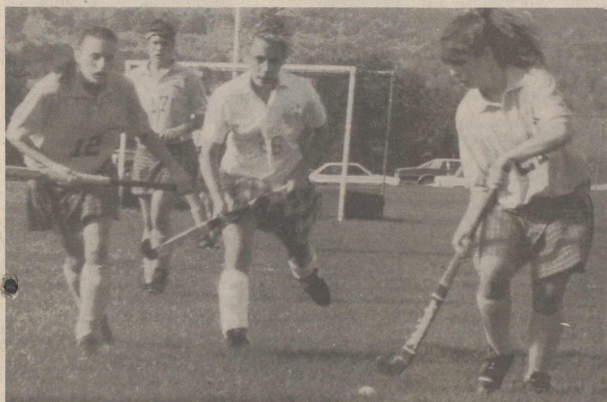
FAST ACTION - Play was hot and heavy when the Dallas and Lake-Lehman field hockey teams met last week. Lehman came away the 1-0 winner of an exciting match.

Vol. 103 No. 38 Wednesday, September 16, 1992