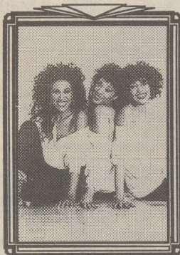
THE POINTER SISTERS Friday, July 17 8:00 P.M. Tickets $35 & $28