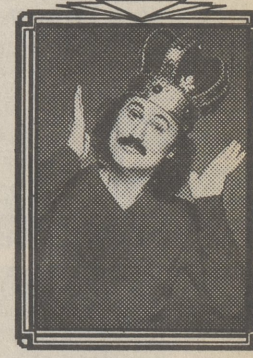
GALLAGHER Sunday, October 4 7:00 P.M. Tickets $28 & $23