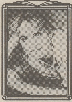
OLIVIA NEWTON JOHN Tuesday, August 25 8:00 P.M. Tickets $50, $40 & $35