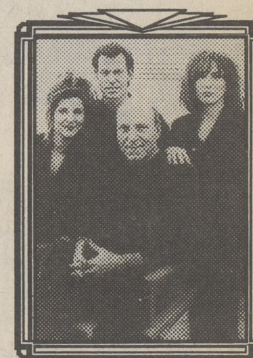
MANHATTAN TRANSFER Wednesday, August 12 8:00 P.M. Tickets $27 & $22