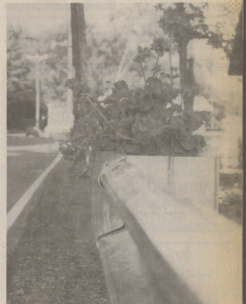
PLANTER WITH A PURPOSE — Some Harveys Lake folks have put newly installed guardrails around the lake to good use, making planters of the metal knuckles on the ends of the rails.