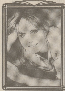
OLIVIA NEWTON JOHN Tuesday, August 25 8:00 P.M. Tickets $50, $40 & $35