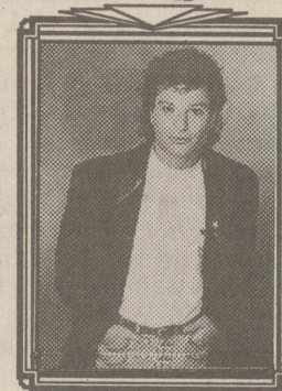
HOWIE MANDEL Thursday, September 24 8:00 P.M. Tickets $24