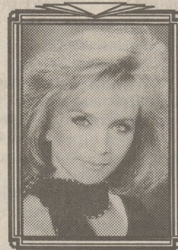
BARBARA MANDRELL Friday, July 31 6:30 P.M. & 9:30 P.M. Tickets $32 & $25 Co-sponsored by 33.7 WTLN