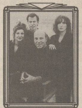
MANHATTAN TRANSFER Wednesday, August 12 8:00 P.M. Tickets $27 & $22