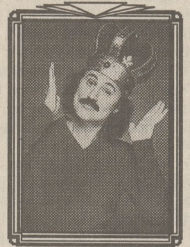
GALLAGHER Sunday, October 4 7:00 P.M. Tickets $28 & $23