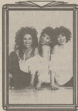
THE POINTER SISTERS Friday, July 17 8:00 P.M. Tickets $35 & $28