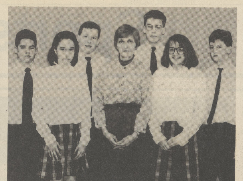
Gate of Heaven students win in science

WEDNESDAY - Italian meatballs, tomato sauce on hard roll, green beans, fruit, milk.