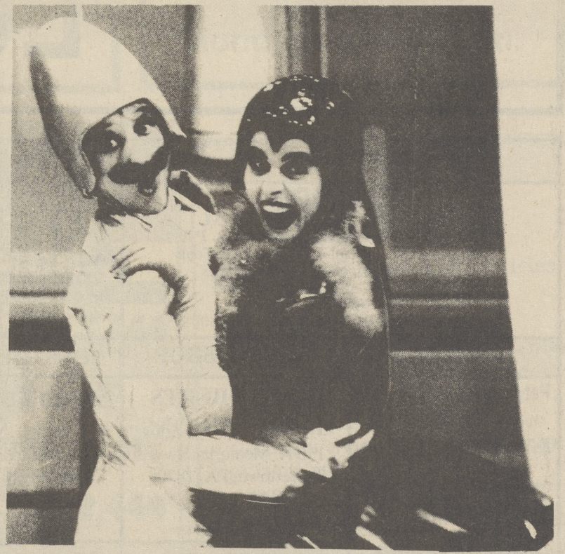
HOMEBUGGIES - "Flit, Flit," a Spanish dance performance features the antics of bugs who share our houses, will perform at the Children's Theater Festival in Wilkes-Barre on May 13 to 15.

Tickets are available at the Kirby Box Office for $4/daytime show. Golden Passes for $12 allow admittance to any show any day (based on availability). For further information, call 829-KIDS.