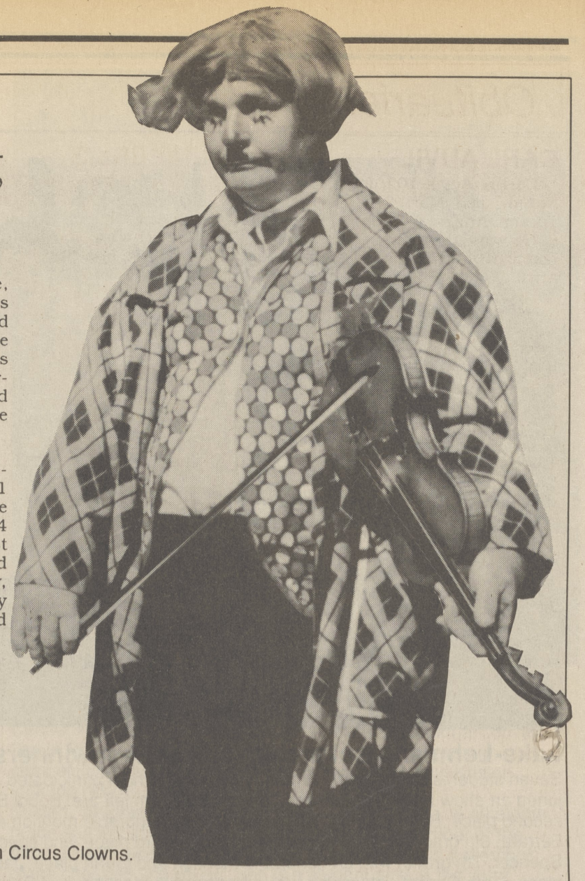
SAD SACK - Shown is one of the famous Carden Circus Clowns.

General admission is $3. Reserved seats are $4, $7, $9, $11 and $12. Tickets are on sale at the Irem Temple Box Office from 9 to 4 p.m.; Boscov's, Wilkes-Barre; West Side Mall, from 10 to 8 p.m. and Circus Box Office, 109th Armory, Kingston, from 9 to 4 p.m. Friday night performances have reserved seating only.