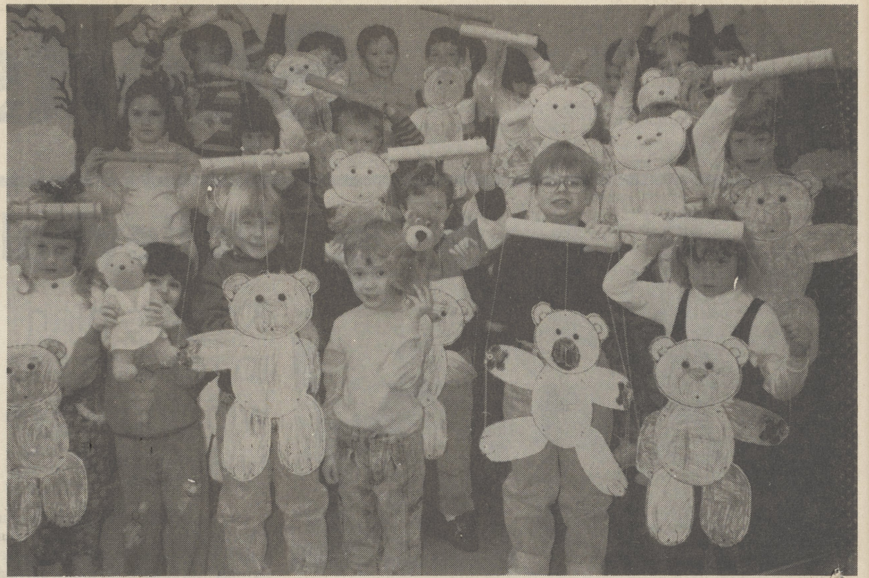
BEARING THEIR GRINS - Students at the Dallas Elementary School show off the bear marionettes they made as part of the school's "Bear Week."