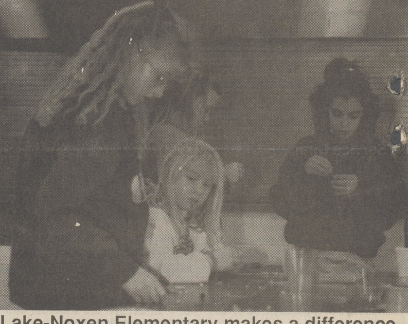
Lake-Noxen Elementary makes a difference

Three types of candy pars (crunch, almond and nut) are still available for $1 each from any PTA member. And volunteers are needed to help install the fitness course, once warm weather ar-