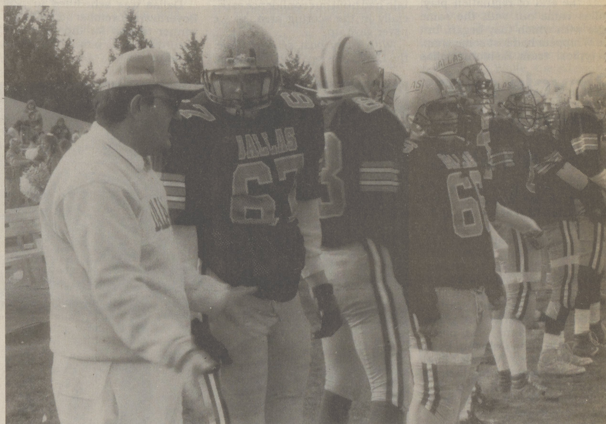
Encouragement from the coach

Lake-Lehman was 3-7 overall and 1-6 in the division, but things should look up next year when 26 lettermen could return.