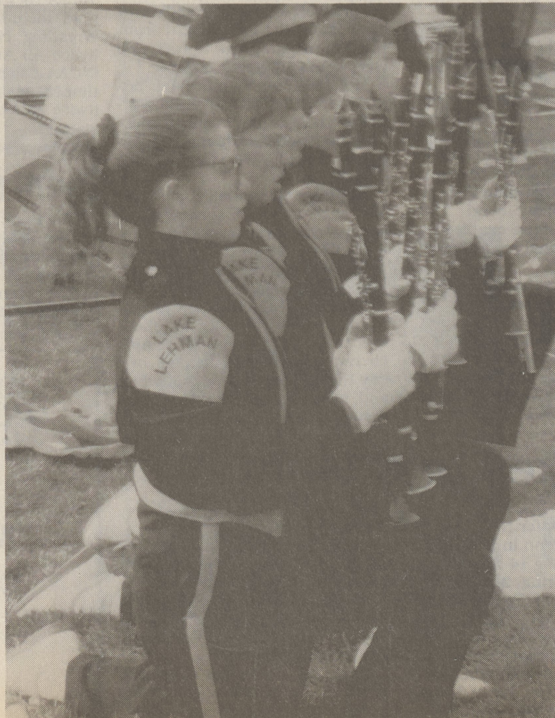
And the band played on